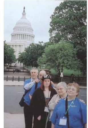
LAC and relatives in D.C.

Over the past year, the LAC has held several fundraisers to pay for travel expenses, accommodations and fees to attend this conference. Additional financial support was provided by LVGS, Sanford Community Adult Ed, and Altrusa International. Thank you for your continued support as our students promote adult literacy here and around the nation!