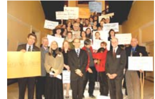
Maine Nonprofits at the State House during Press Conference